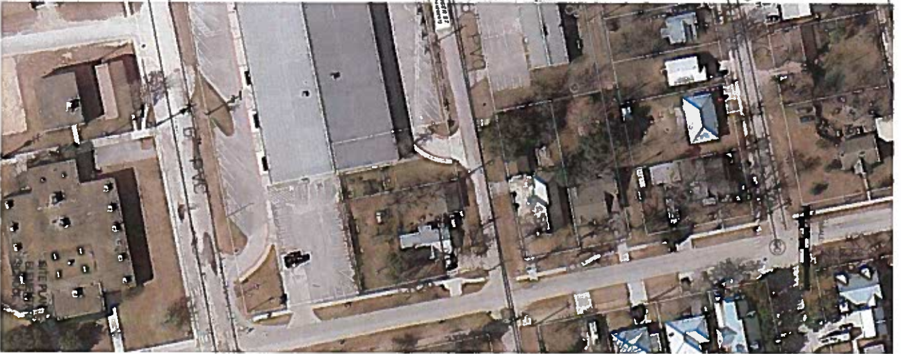
Exhibit A Cunningham from Huebinger to Ohio